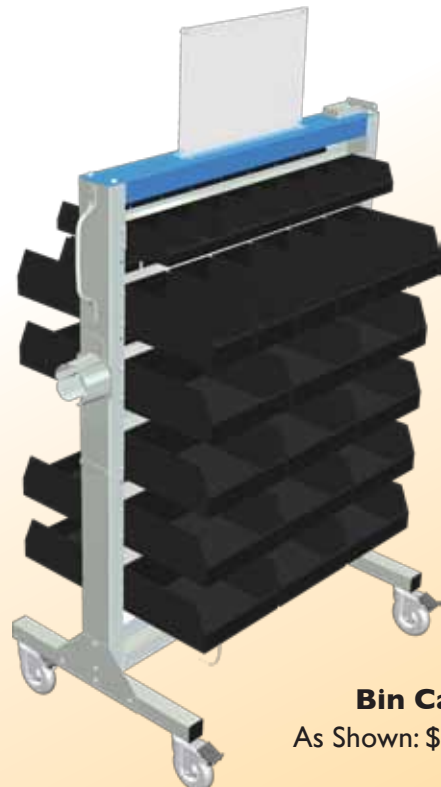
Bin Cart As Shown: $2,538.40