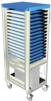
Blade / PC Board Cart