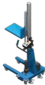
Bliss Data Center Lift