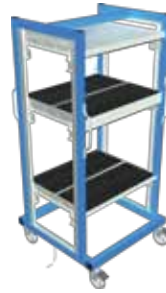
Vertical PC Board Cart