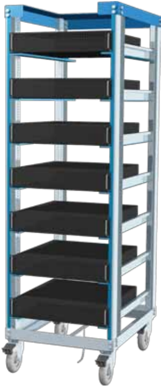
Chassis Cart As Shown: $1,295.00

For Cables, PC Boards, Chassis, and more