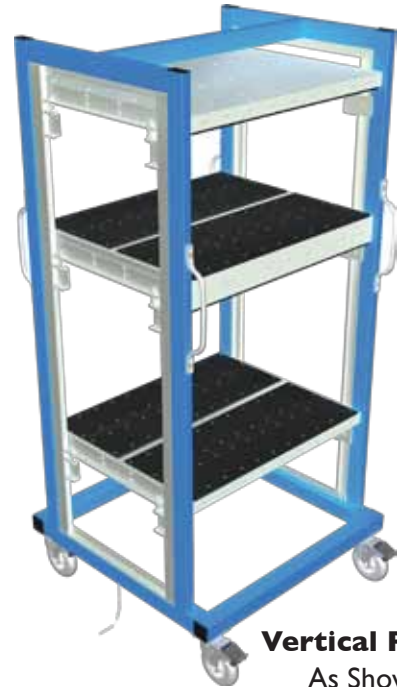
Vertical PC Board Cart As Shown: $2,610.75