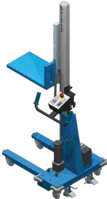
Bliss Data Center Lift As Shown: $7,315.75