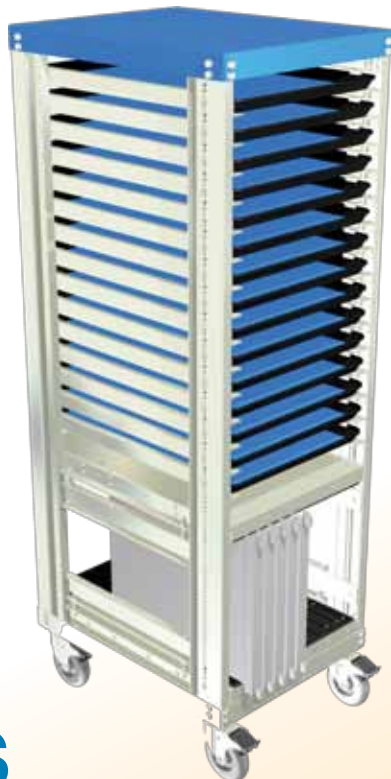
Blade / PC Board Cart As Shown: $2,858.25